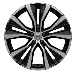
20" 5 Y Spoke (#1264)