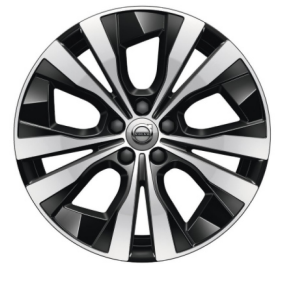
18" 5 Double Spoke (std Core)