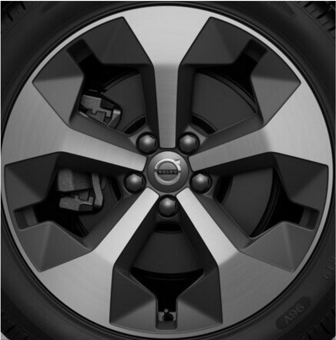
19" Wheel (Std Plus)