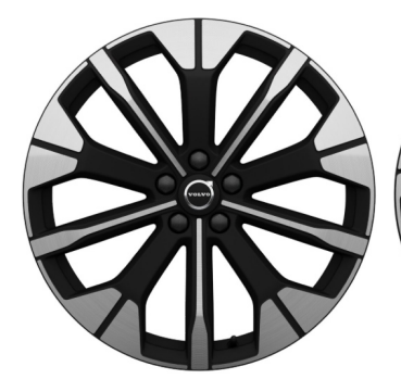
20" 5 Y Spoke (#1301)