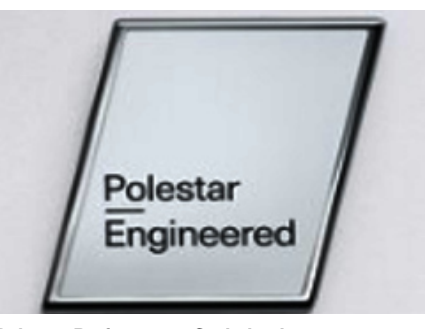
Polestar Performance Optimisation