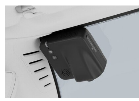
Dash Camera - front and rear