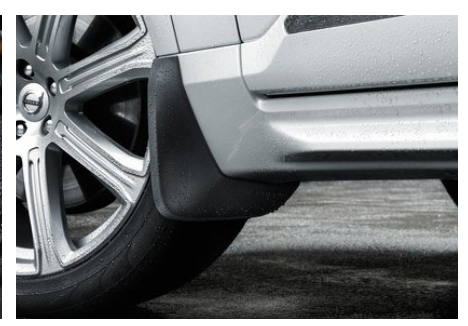
Mudflaps - front and rear