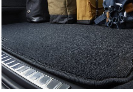
Textile Protection - interior cabin floor mats and load compartment mat