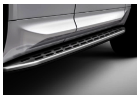
Integrated Running Boards