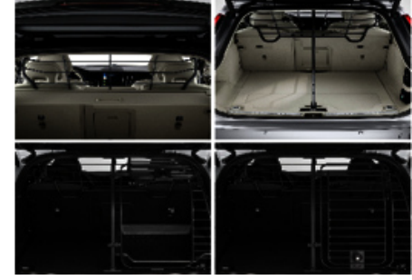
Pet Accessories - protective steel grille, dog gate, load divider and dog load liner

We have an extensive range of protection, convenience, lifestyle and adventure Accessories for your Volvo and you can browse our entire range here: https://volvocarsaccessories.co.uk