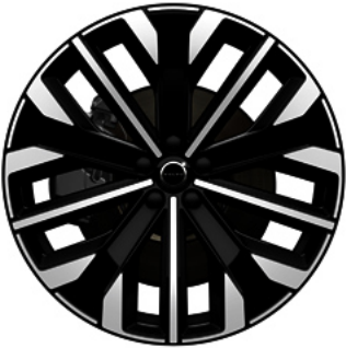
21" 5 V-Spoke (#1320)