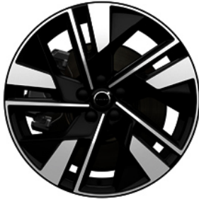
19" 5 Double Spoke (#1299)