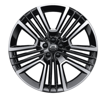
21" 5 Triple Open Spoke (#800141)