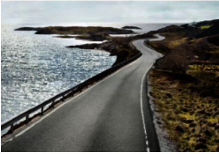
Vodafone Automotive VTS S5 Tracker - with 3 years subscription