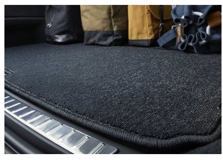
Textile Protection - interior cabin floor mats and load compartment mat