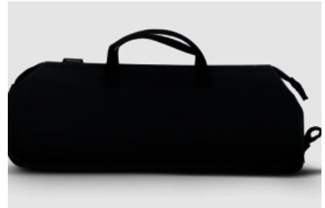
Charging Cable Bag