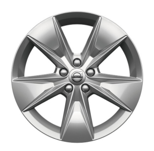
18" 5 Spoke (std Core)