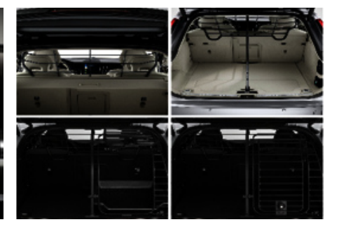
Pet Accessories - protective steel grille, dog gate, load divider and dog load liner

We have an extensive range of protection, convenience, lifestyle and adventure Accessories for your Volvo and you can browse our entire range here: https://volvocarsaccessories.co.uk