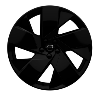
20" 5 Spoke (std Black Edition)