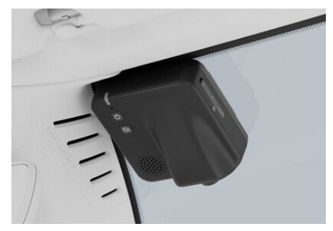
Dash Camera - front and rear