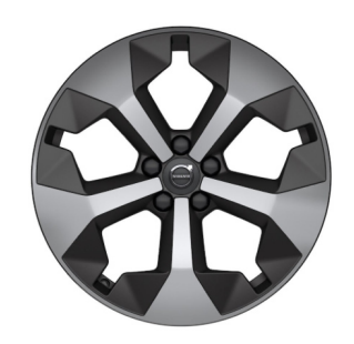
19" 5 Y Spoke (#1240)