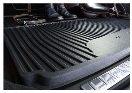
All-weather Protection - interior cabin floor mats and load compartment mat