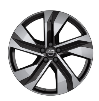
20" 5 Spoke (#1243)