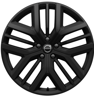
22" 5 Y-Spoke (#1345)