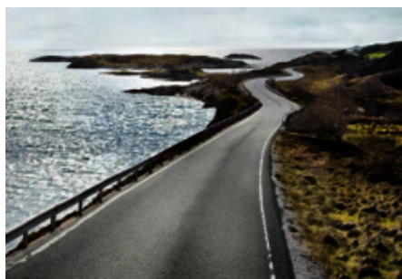
Vodafone Automotive VTS S5 Tracker - with 3 years subscription