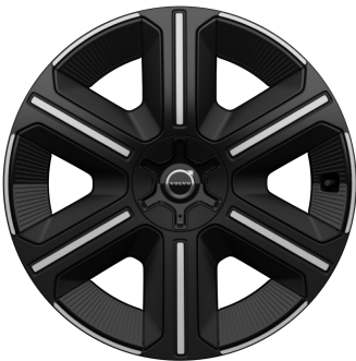
21" 6 Spoke (#1304)