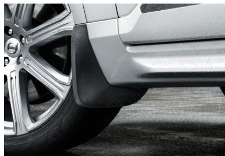
Mudflaps - front and rear