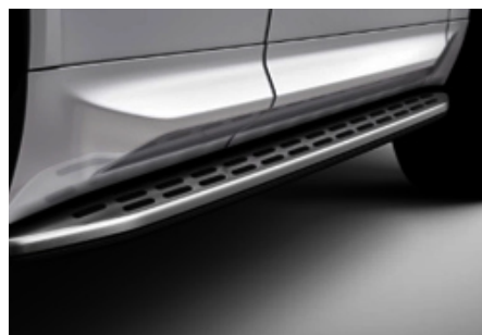
Integrated Running Boards