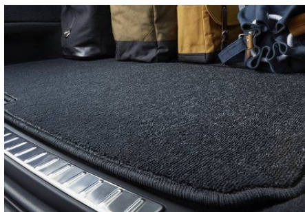
Textile Protection - interior cabin floor mats and load compartment mat