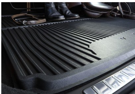
All-weather Protection - interior cabin floor mats and load compartment mat