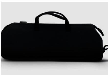
Charging Cable Bag