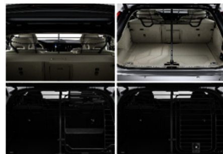
Pet Accessories - protective steel grille, dog gate, load divider and dog load liner

We have an extensive range of protection, convenience, lifestyle and adventure Accessories for your Volvo and you can browse our entire range here: https://volvocarsaccessories.co.uk