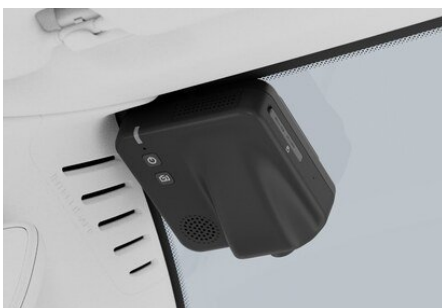
Dash Camera - front and rear