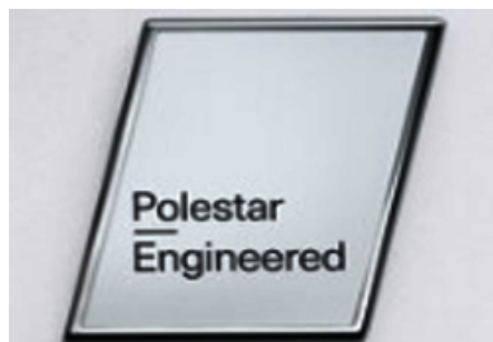
Polestar Performance Optimisation