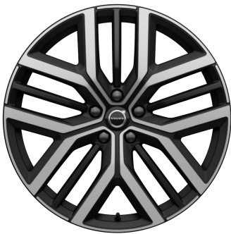
22" 5 Y-Spoke - Diamond Cut (#1297)