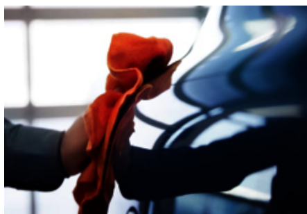
Volvo Car Protect - available for both textile and leather interior, plus exterior paint