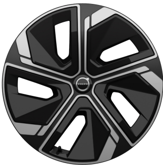
20" 5 Spoke