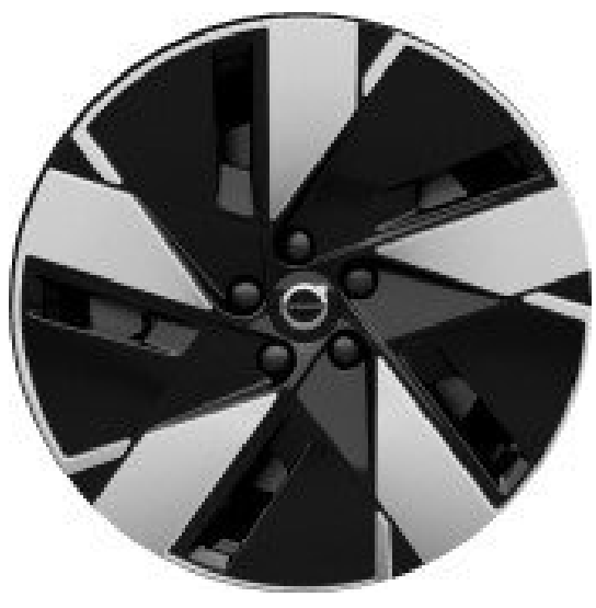
19" 5 Spoke (std Plus)