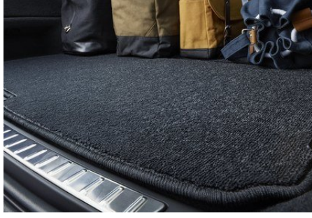
Textile Protection - interior cabin floor mats and load compartment mat