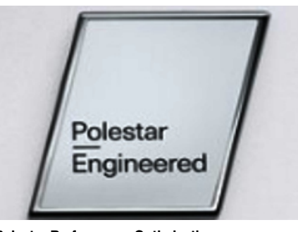
Polestar Performance Optimisation