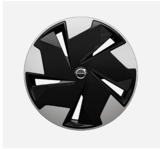
19" 5 Spoke