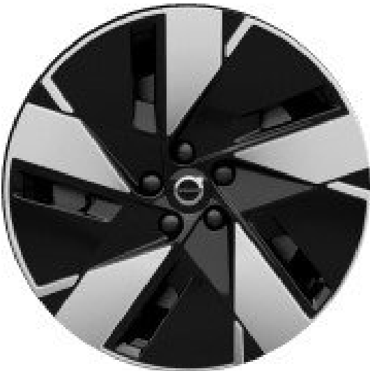
19" 5 Spoke (Std Plus)