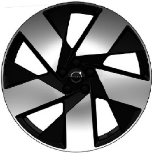
20" 5 Spoke (#1185) Std Ultimate