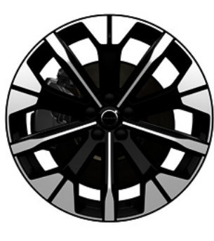
20" 5 Y Spoke (#1301)