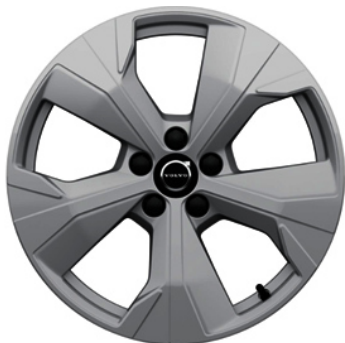
18" 5 Spoke (#1300)