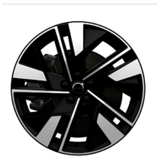
19" 5 Double Spoke (#1299)