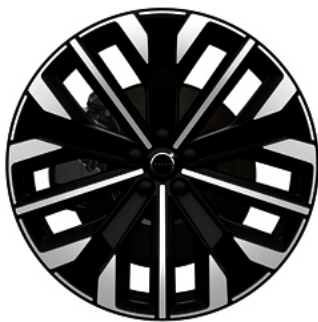
21" 5 V-Spoke (#1320)