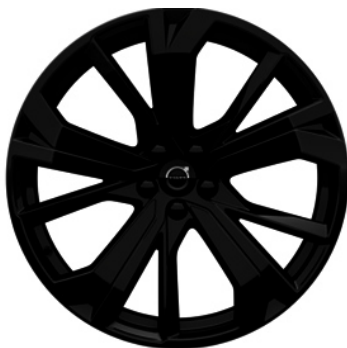
21" 5 Double Spoke (std Black Edition)