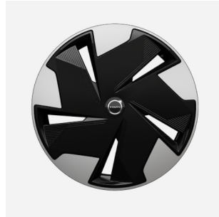
19" 5 Spoke Aero