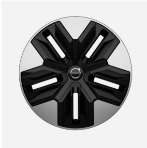
18" 5 Spoke Aero