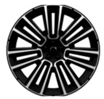
22" 7 Multispoke Black Diamond Cut Alloy Wheel (#1286)(Optional Ultra Trim Level)