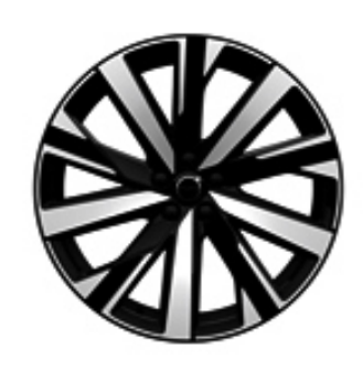
20" 5- Multi Spoke black Diamond Cut Alloy (#1284) Standard Plus Trim Level)