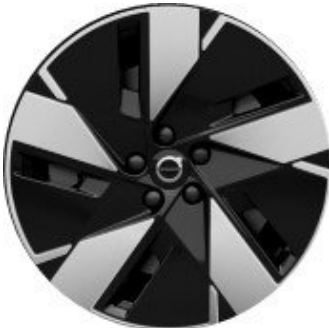
19" 5 Spoke (Std Plus)