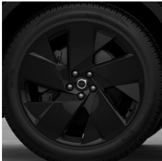
20" 5 Spoke Std Black Edition