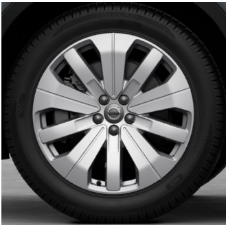
19" 5 Spoke (Std Core)