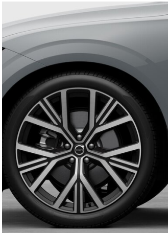
22" Y Spoke Alloy Wheels (Diamond Cut/High Gloss Black) with 255/40 (front) and 285/35 (rear) Optional Ultra Trim Level