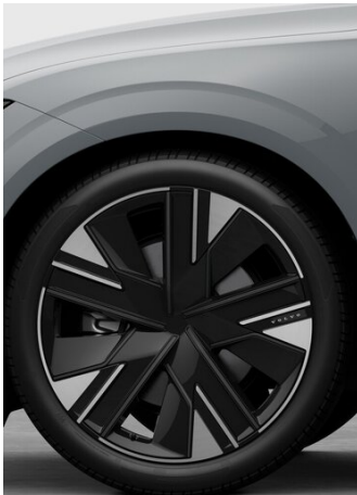
22" 5 Spoke Aero Alloy Wheels (Diamond Cut/High Gloss Black) with 255/40 (front) and 285/35 (rear) Optional Ultra Trim level