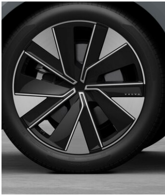
+21 5 spoke Diamond Cut/High Gloss Black) with 245/45 (front) and 275/40 (rear) Tyres Standard Ultra Trim level Optional Plus trim level