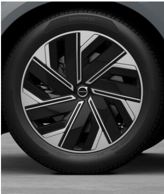
+ 20" 7 Spoke Aero Alloy Wheels (Diamond Cut/High Gloss Black) with 245/40 (front) and 275/45 (rear) Tyres Standard Core and Plus trim level